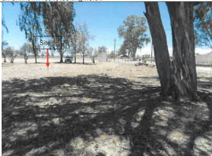
Figure 4: A view of the proposed site (red arrow), looking in an eastern direction.