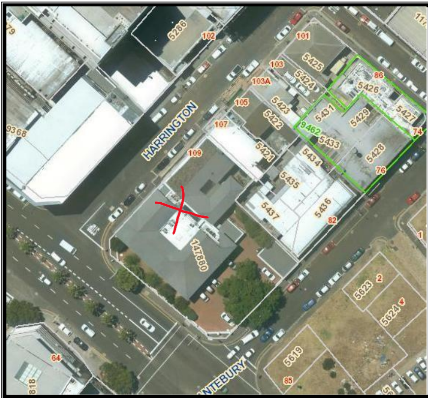
Figure 1: Locality map: Erf 147880, 109-111 Harrington Street, SAHRA office