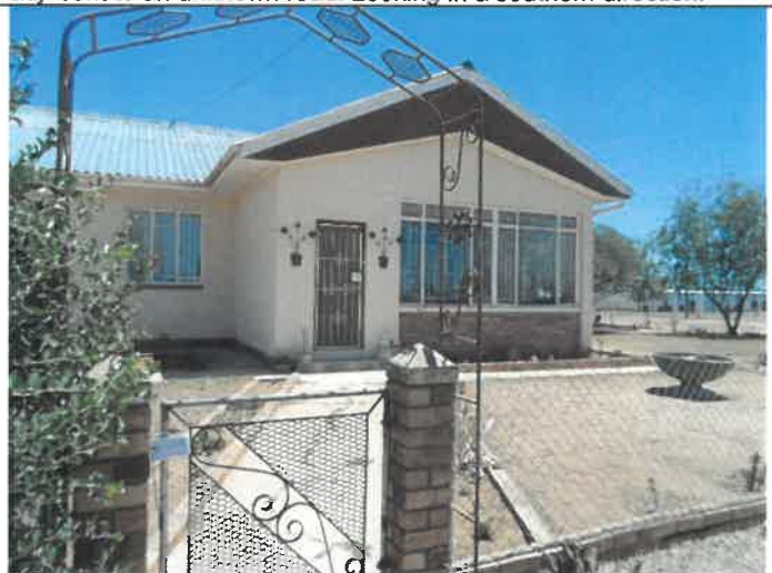
Figure 8: Maildrop placed at a residence located along Andries Louw Street. Looking in a western direction.