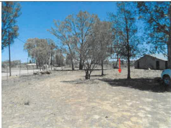
Figure 3: The site (red arrow) is located adjacent to some bluegum trees. Looking in a south-western direction.