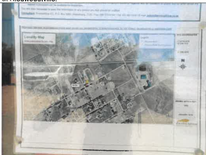
Figure 14: Poster placed on window inside Hantam Municipal Office at Nieuwoudtville.