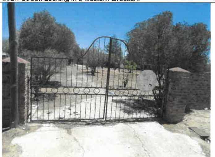
Figure 10: Maildrop placed in gate at the property immediately north-west of the site, as viewed from Du Toit Street, looking in a western direction.