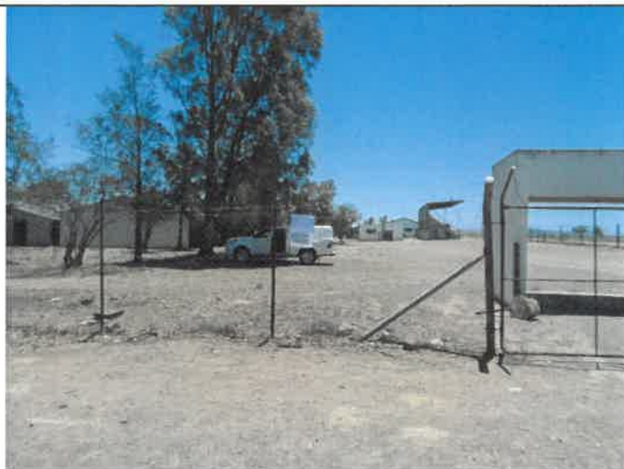
Figure 1: Poster placed on the boundary fence of Nieuwoudtville Sportsgrounds, adjacent the entrance gate to the site. Viewed from an unknown road, looking north.