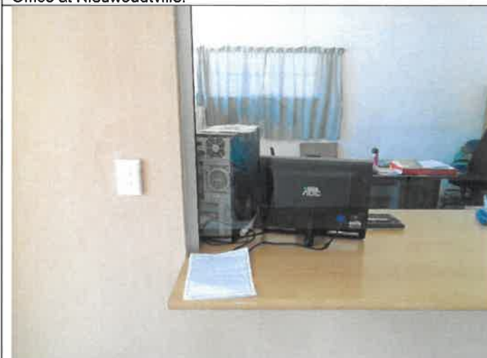
Figure 15: Maildrops/ handouts placed on the reception desk of the Municipal Office.