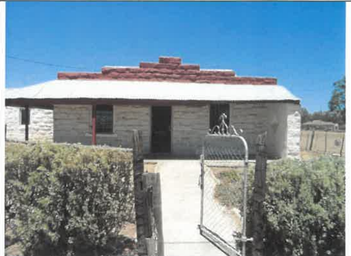
Figure 6: Maildrop placed at the residence opposite the site, adjacent to an unknown road. Looking in a southern direction.