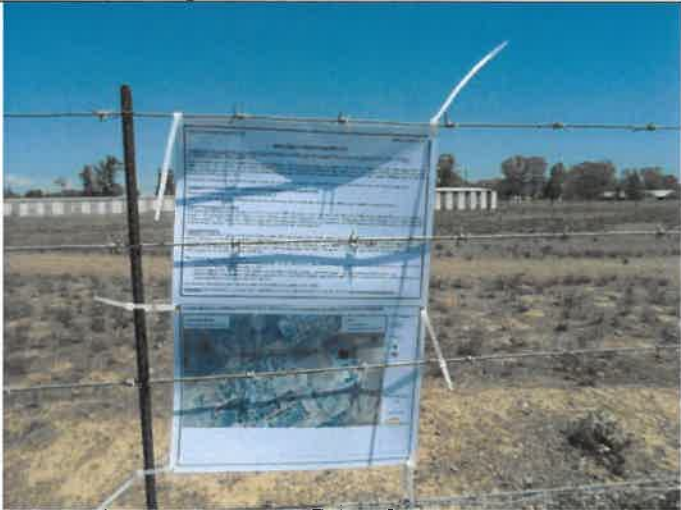
Figure 19: Poster placed along a fence, next to a pedestrian walkway. Looking towards Nieuwoudtville Sportsgrounds. Looking in a south-western direction.