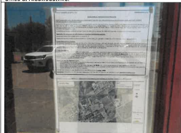
Figure 13: Poster placed on window inside Hantam Municipal Office at Nieuwoudtville.