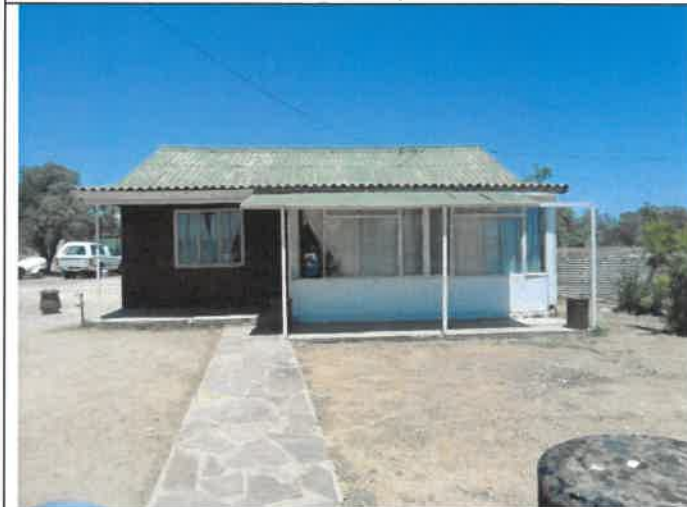
Figure 7: Maildrop placed at the residence located along an unknown gravel road. Looking in a southern direction.