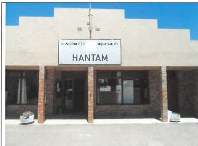
Figure 11: Poster placed on window inside Hantam Municipal Office at Nieuwoudtville.