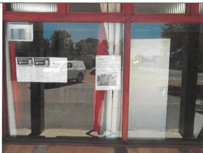
Figure 12: Poster placed on window inside Hantam Municipal Office at Nieuwoudtville.