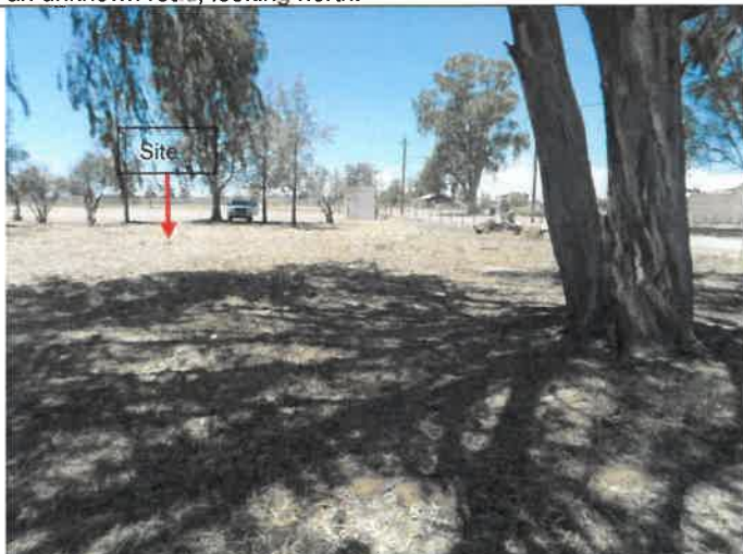
Figure 4: A view of the proposed site (red arrow), looking in an eastern direction.