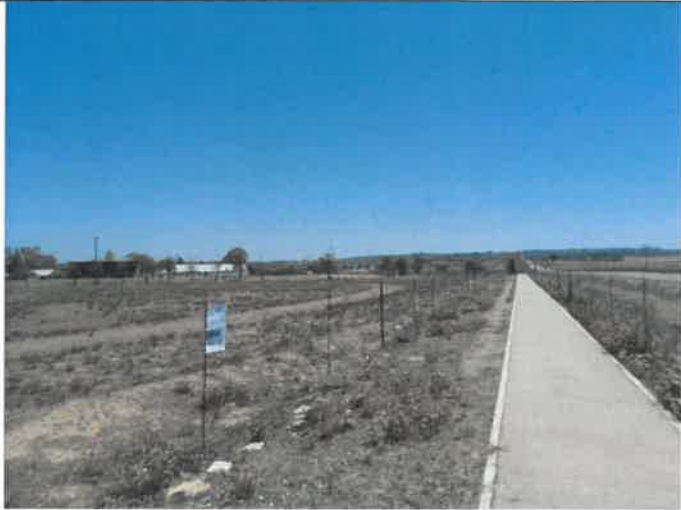
Figure 17: Poster placed along a fence, next to a pedestrian walkway. Looking towards Nieuwoudtville Sportsgrounds. The R27 is located to the right.