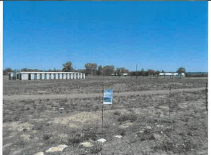
Figure 18: Poster placed along a fence, next to a pedestrian walkway. Looking towards Nieuwoudtville Sportsgrounds. Looking in a south-western direction.