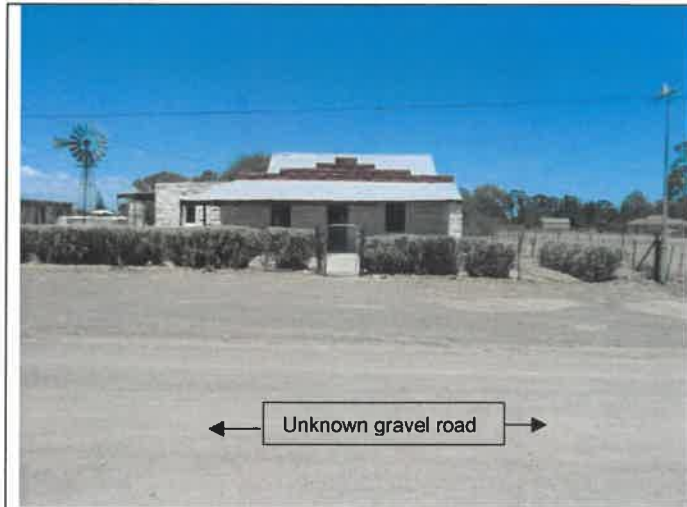
Figure 5: Maildrop placed at the residence opposite the site, adjacent to an unknown road. Looking in a southern direction.